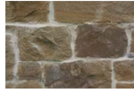
Details of the repairs