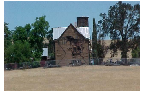
The south wall remains unrepaired today. Rain is a constant threat to the house.