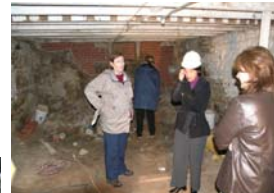
Inspecting the basement