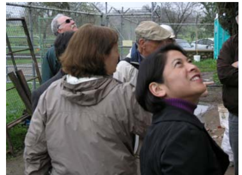
Representatives from State Parks and the CCHE inspect the emergency repairs.