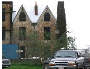
The old house getting a face lift