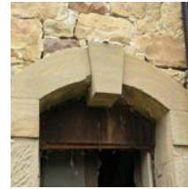
Example of the careful restoration