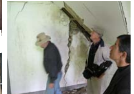
Money to repair the interior needs to be raised.