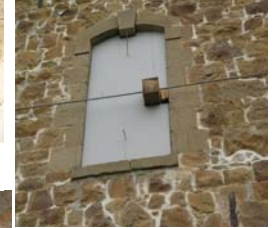
Keeping out the rain