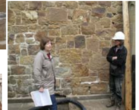
Proud of their work