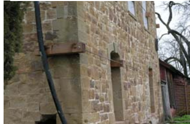
Repaired and braced