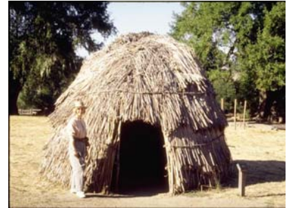
Replica of a Miwok home

We also encourage members of the Friends of John Marsh to write and give the Trust any additional ideas for the park that you may have.