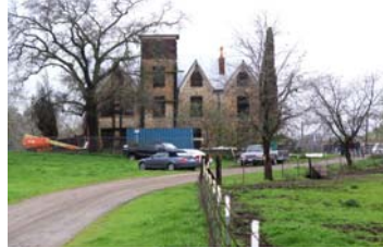
Facelift for the "Old Lady"

$58,000 was reserved by you for stabilization. The Trust has spent $85,000 on this effort. Hopefully the upcoming fundraiser, membership renewals and donations will recharge the stabilization fund. To date 98 cents of every dollar contributed has been spent on fixing the Stone House.