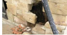
Ready for repair