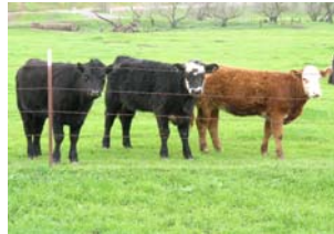
A few of the local “sidewalk” superintendents