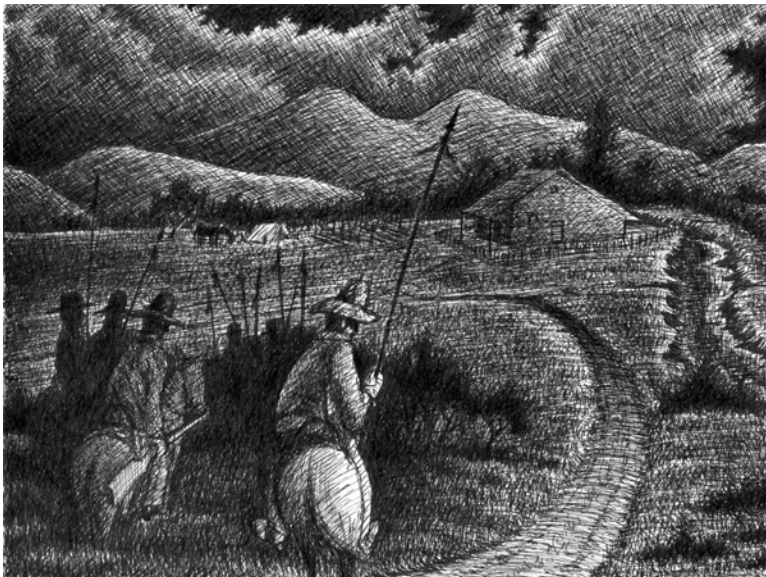
The midnight attack on the Marsh Rancho, December 5, 1850