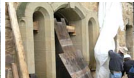
Unveiling the new arches