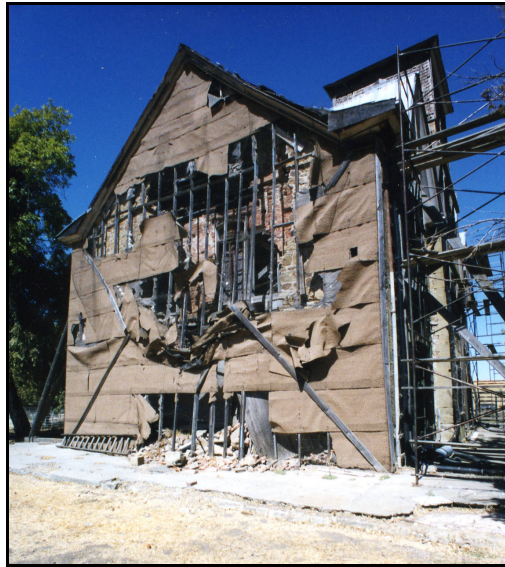
The south wall is the greatest emergency.

The JMHT initially applied to the CCHE for $300,000 grant to prepare the exterior rehabilitation construction plans. Although a bare-bones request, the CCHE cut the request by $100,000. This left the grant woefully underfunded to make the required plans and drawings. The board of the JMHT voted unanimously to take up to an additional $120,000 from the Trust in order to supplement the state